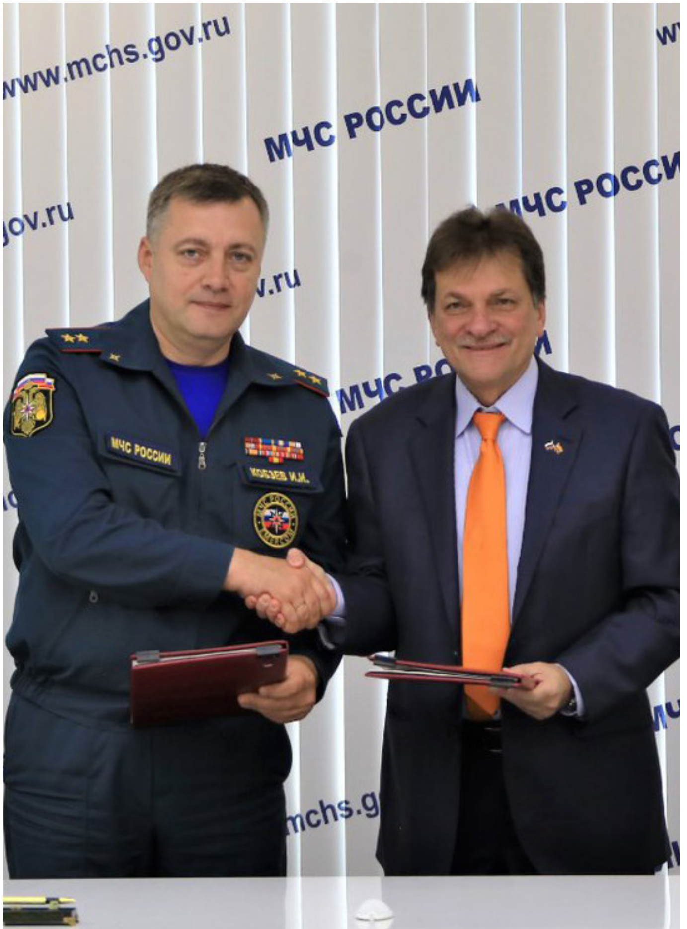
▲ National Commission for Economic Cooperation with Latin America, Moscow, Russia, 2019.