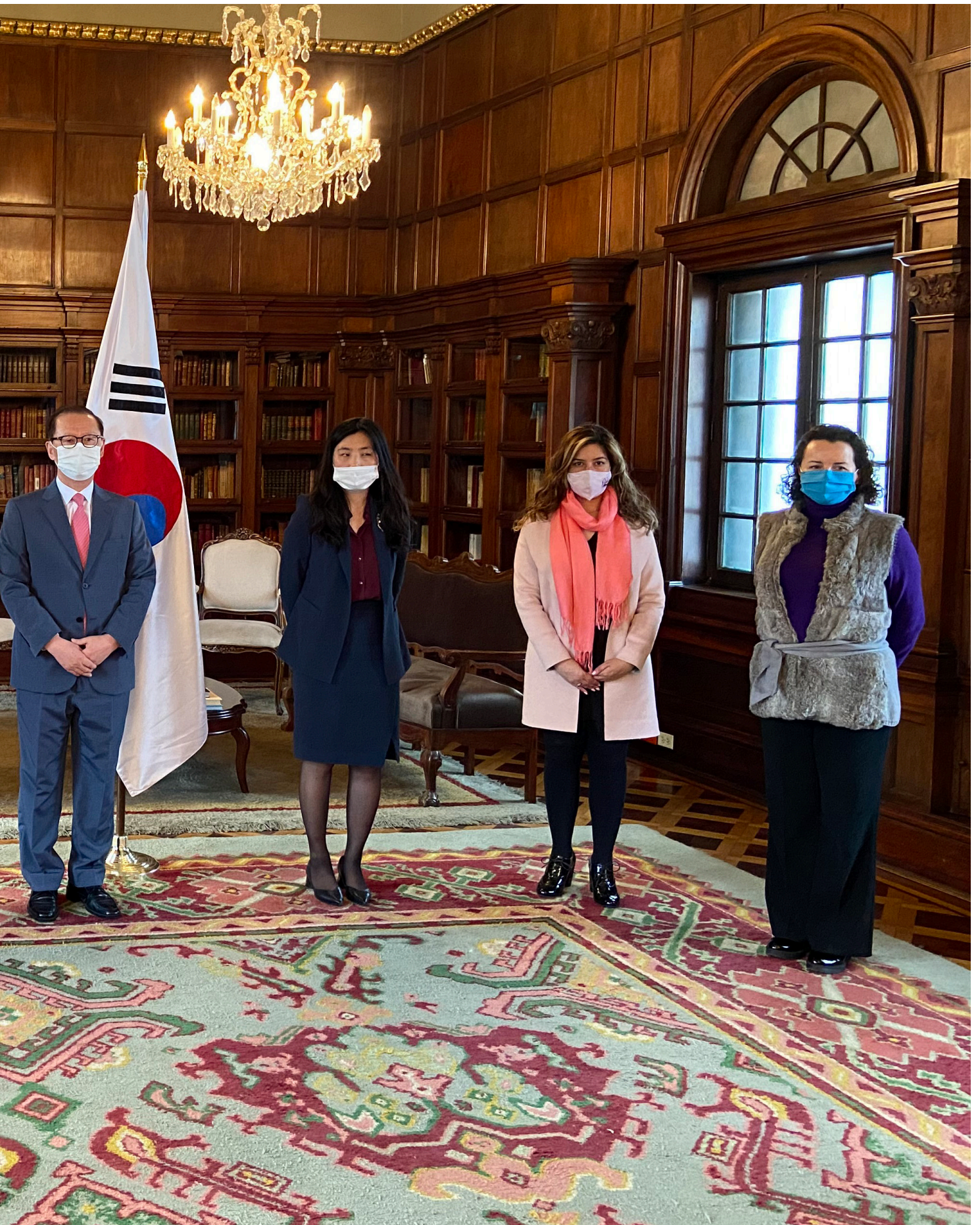
▲ Support received from the Japanese Government in the emergency caused by IOTA hurricane in Colombia, December, 2020.