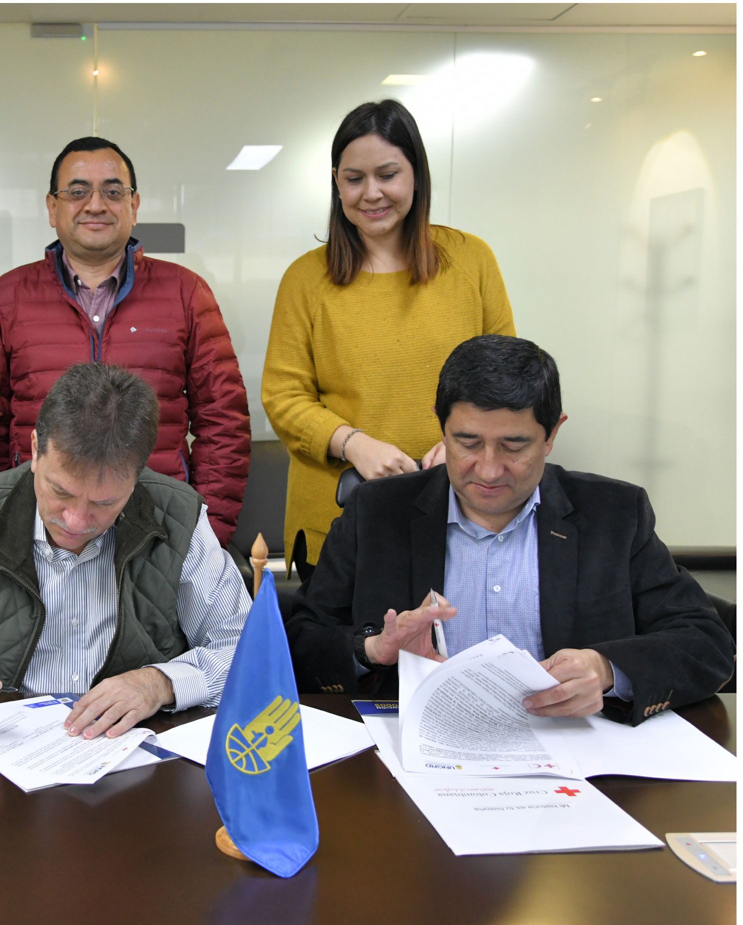
▲ Letter of Intent subscribed between UNGRD and Colombian Red Cross Articulation of Disaster Risk Management efforts, Bogotá, November, 2019.