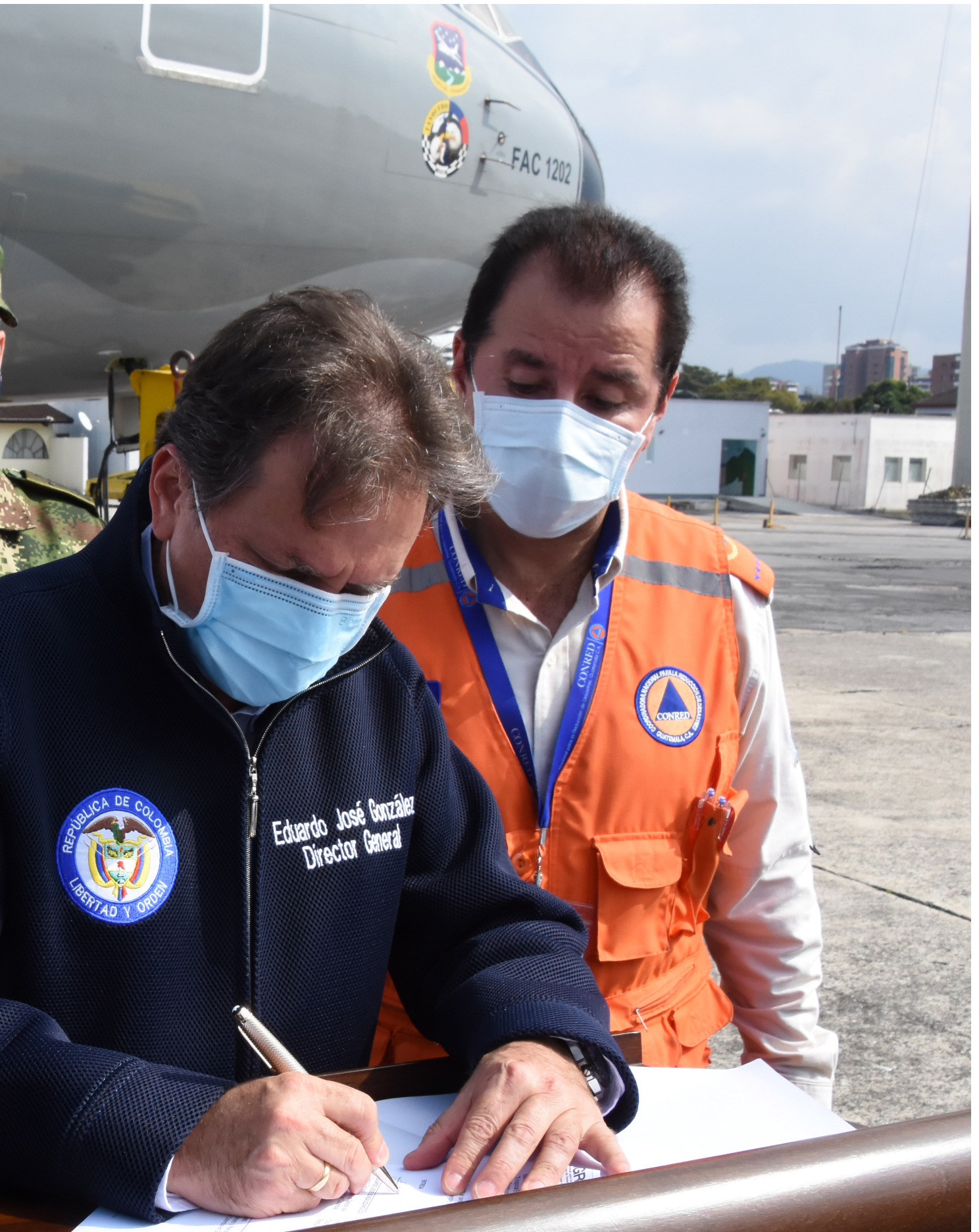
▲ Delivery of Emergency Humanitarian Aid for the Government of Guatemala during hurricane season, November 2020.