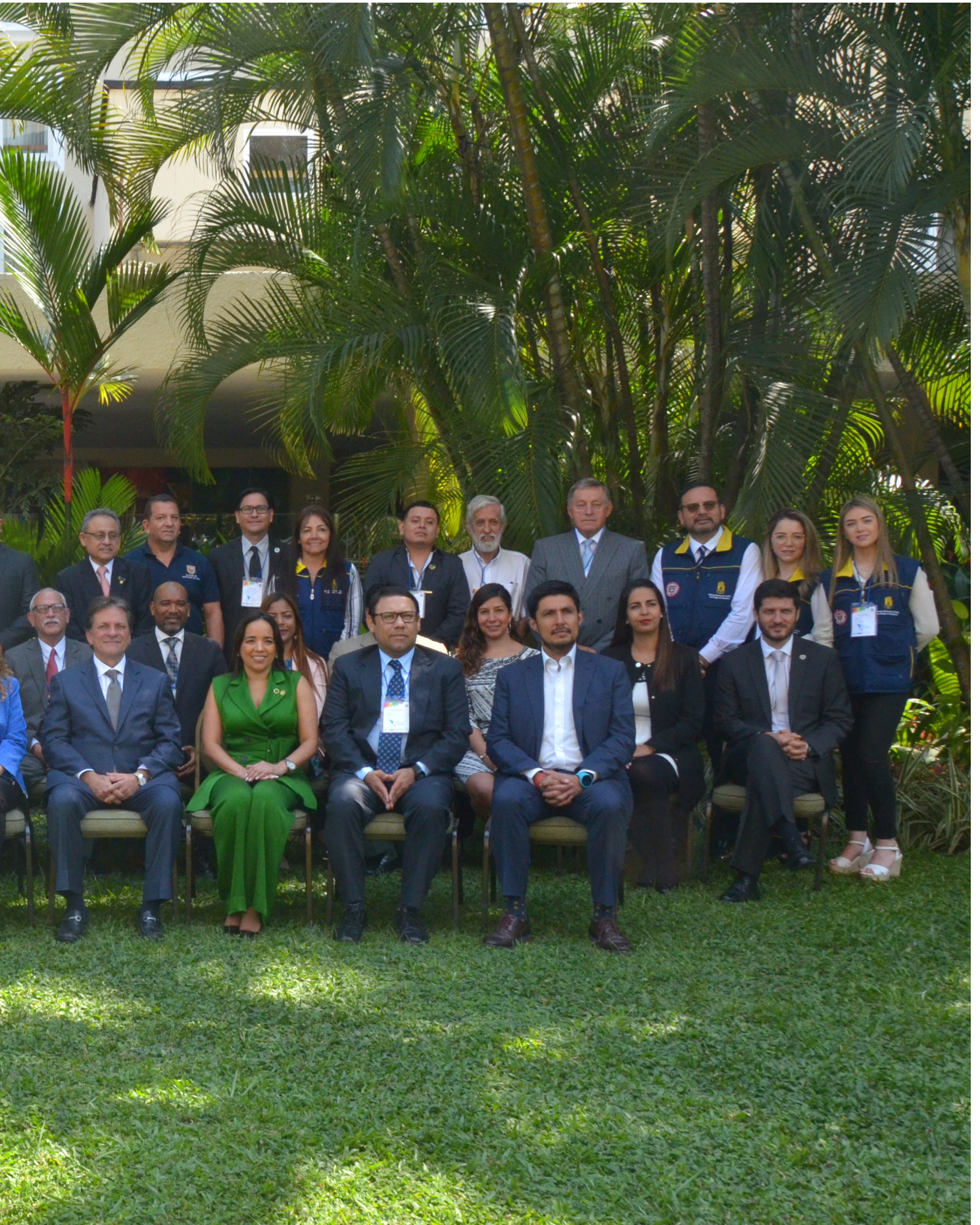
▲ First Mesoamerican Dialogue on Regional Cooperation, Alliance Generation and Development funding.