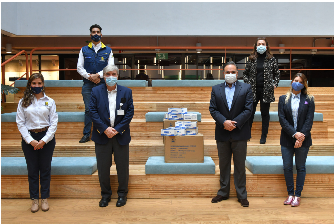
▲ Donation of Personal Protection Elements - COVID 19