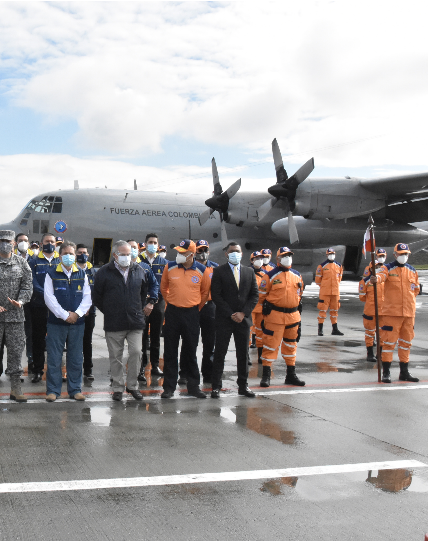
▲ Delivery of Emergency Humanitarian Aid from Colombia to the Government of Honduras. Hurricane season, November, 2020.