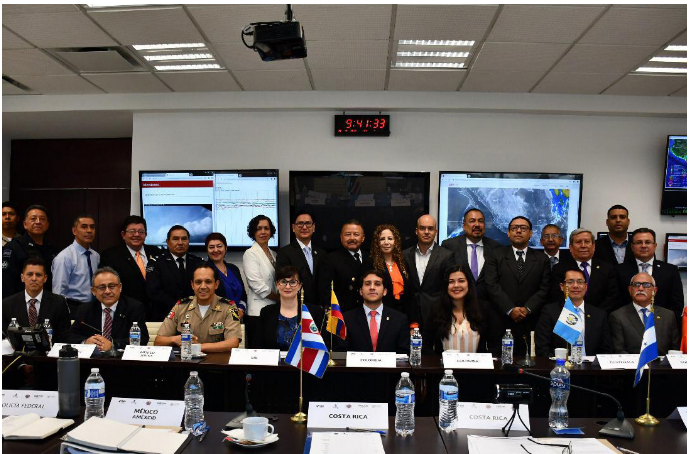
▲ 1. Global Platform for Disaster Risk Reduction, Geneva, Switzerland, May, 2019. 2. Meeting of Regulatory Entities of National Disaster Prevention, Mitigation and Care Systems in the Mesoamerican Region, Mexico, April 2019