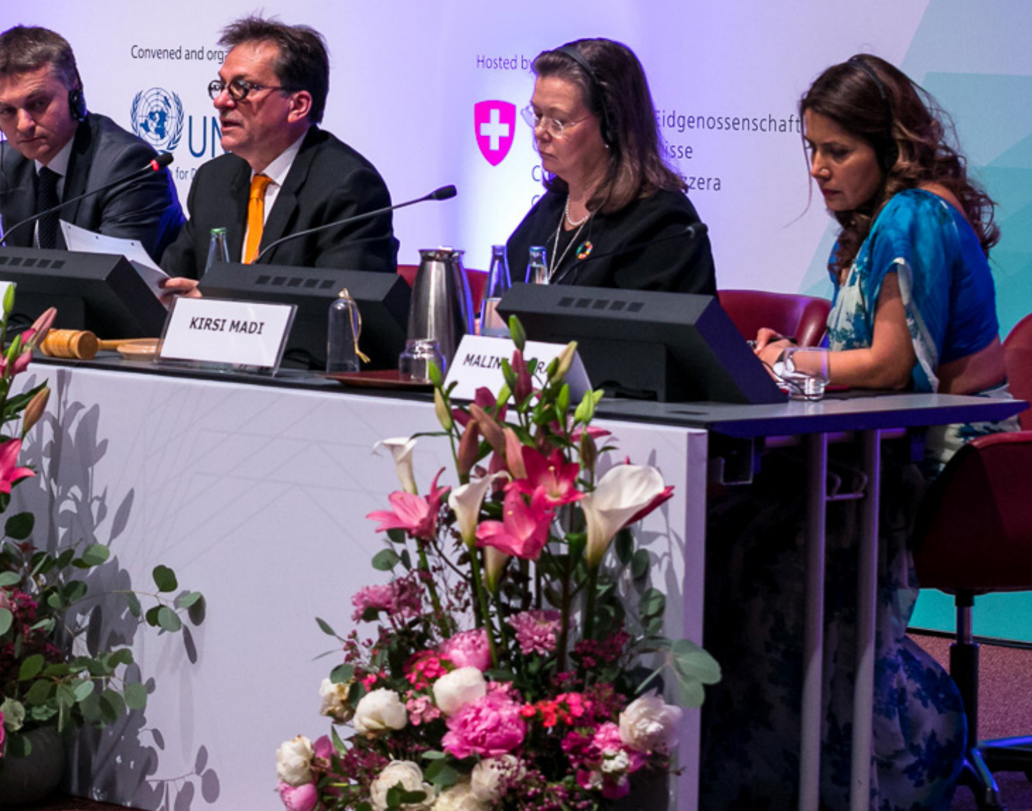
▲ Global Platform for Disaster Risk Management, Switzerland, May, 2019.