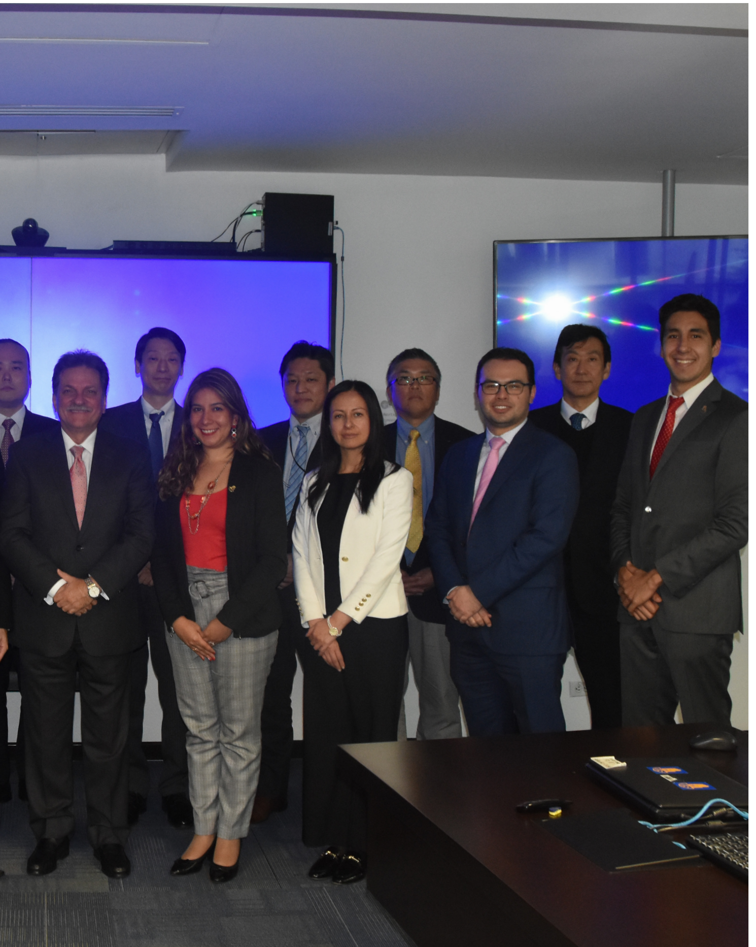
▲ Seminar on Disaster Risk Reduction, Colombia - Japan, February, 2020.